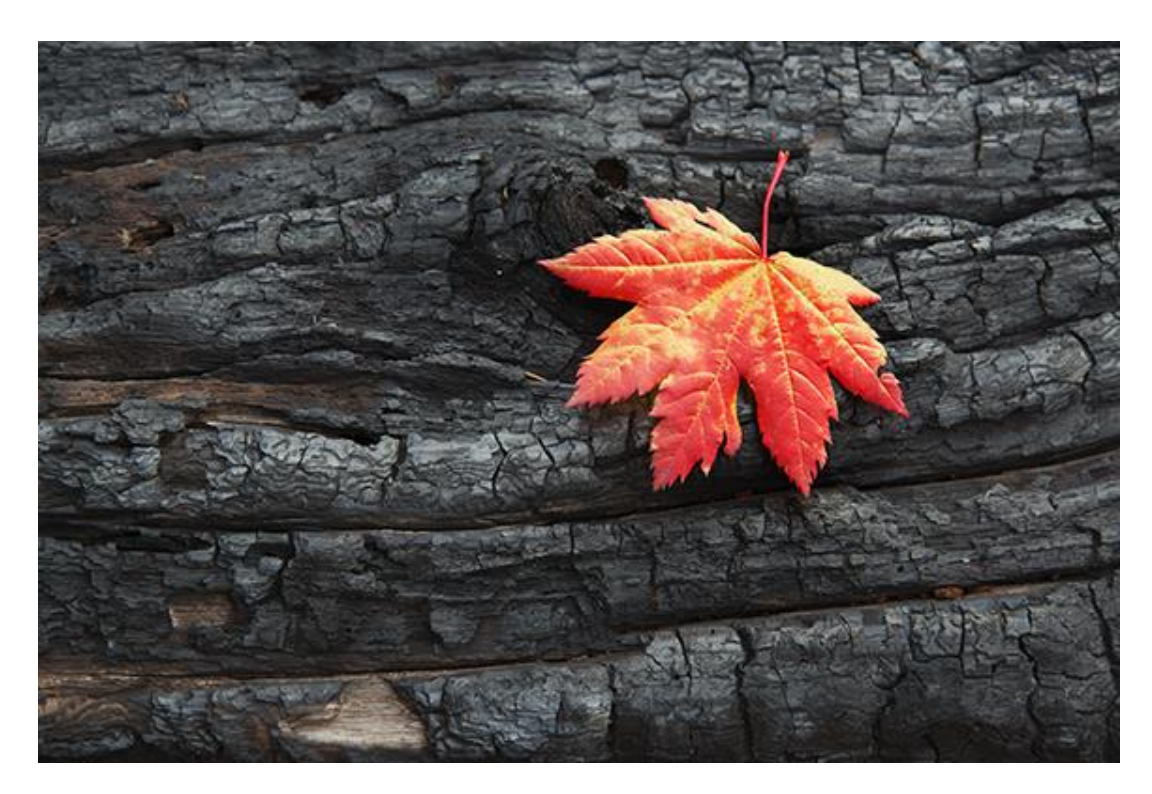
A Collaborative Research Project in Waterloo Region June 2017

THE IMPACT OF THE SYRIAN REFUGEE INFLUX ON LOCAL SYSTEMS OF SUPPORT